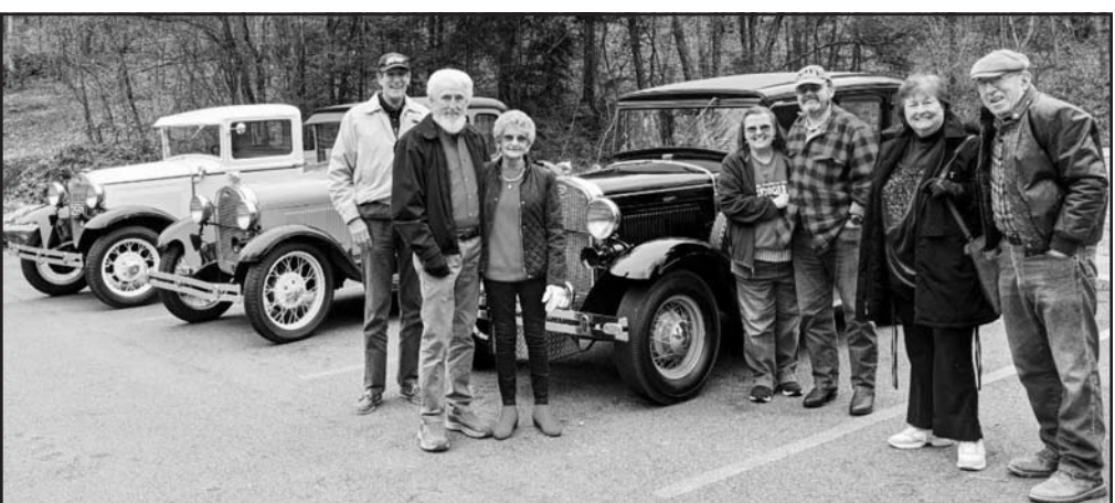
Model A Club Sweetheart Tour