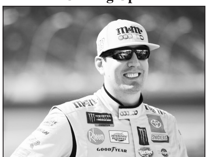
Kyle Busch In 2022

Busch said he had a "valid concealed weapon carry