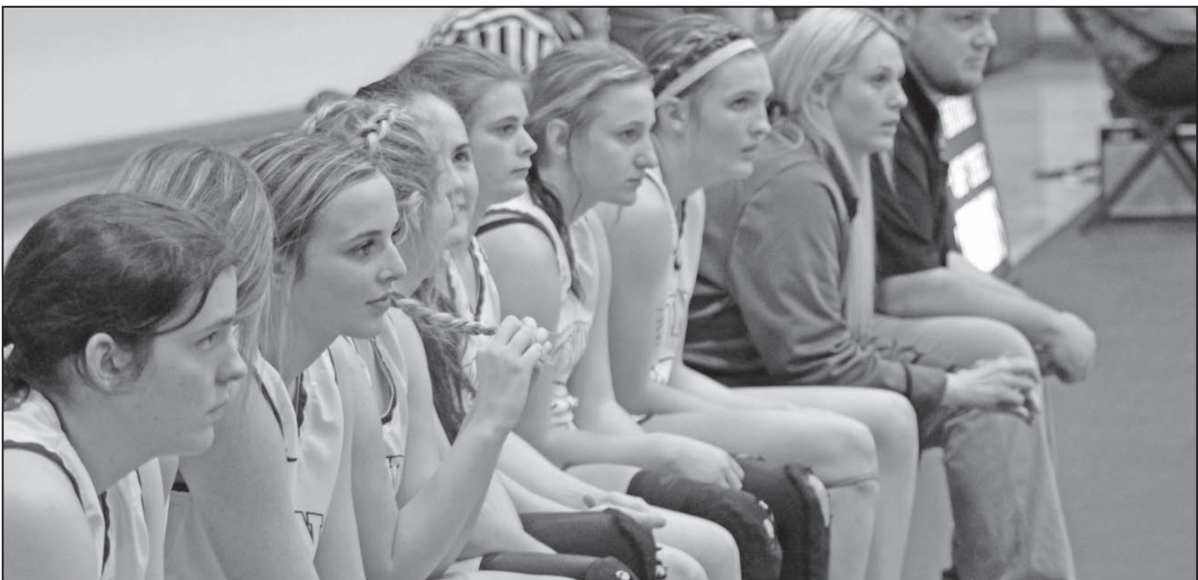
With a first-round bye in this week's Region 8-A tournament, the sixth-ranked Towns County Lady Indians have their eye on a region championship and a berth in next week's GHSA State Tournament.